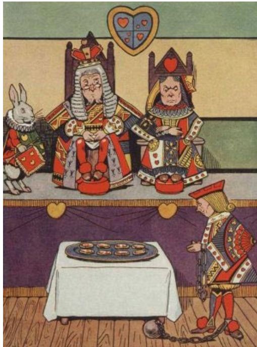
The Trial of the Knave of Hearts.

At this, Alice got up and walked off. The Dormouse fell asleep instantly and neither of the others took the least notice of her going, though she looked back once or twice; the last time she saw them, they were trying to put the Dormouse into the tea-pot.