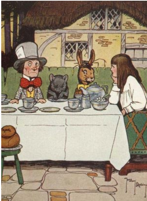
Alice at the Mad Tea Party.

"We, indeed!" cried the Mouse, who was trembling down to the end of its tail. "As if I would talk on such a subject! Our family always hated cats—nasty, low, vulgar things! Don't let me hear the name again!"