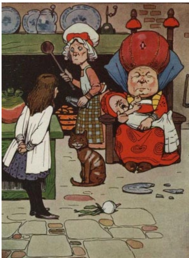
Alice in the Room of the Duchess.

Copyright, 1916, by SAM'L GABRIEL SONS & COMPANY NEW YORK